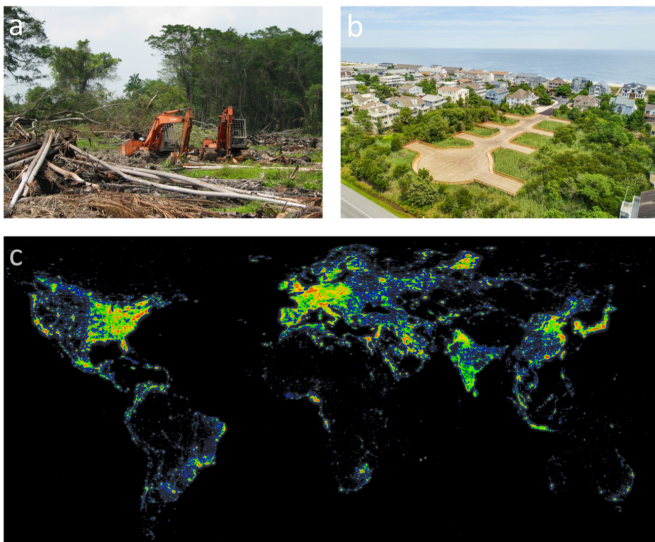
Figure 3. Among the top threats to fireflies globally are habitat loss and artificial light at night. (a) In Malaysia, clearing of riverbank mangroves along the Selangor River for agriculture and aquaculture destroys display trees used by Pteroptyx adults for courtship, and disturbs larval habitat. (b) In Delaware, residential development threatens declining populations of Photuris bethaniensis that are restricted to interdunal freshwater swales. (c) Global map of ALAN based on 2006 satellite data, colors indicate ratio of artificial to natural sky brightness: yellow represents 1–3 times brighter, orange represents 3–9 times brighter, red represents 9–27 times brighter. Map by David Lorenz, https://djlorenz.github.io/astronomy/lp2006 .

Water pollution. Across Asia and in South America, the respondents identified agricultural and industrial runoff containing fertilizers, pesticides, and other water-borne pollutants as the third or fourth most serious threat (table 2). In contrast to the mainly terrestrial larvae of Nearctic fireflies, numerous Asian fireflies have aquatic larvae that inhabit freshwater ponds, rivers, and streams, where they feed and develop through several larval instars (Lloyd 2008). This stage typically lasts for several months, during which both larvae and their snail prey will be exposed to water-borne pollutants.